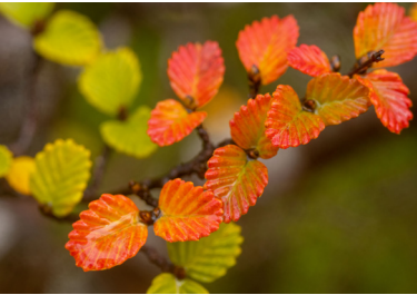
Deciduous Beech, fagus, tanglefoot – Nothofagus gunnii This small endemic tree once lived in Antarctica and is Australia's only cold climate deciduous plant. Before the leaves fall in winter, they go through a spectacular colour change in autumn from a rusty red to a brilliant gold. It can be seen in cooler gardens and Tasmanian National Parks.