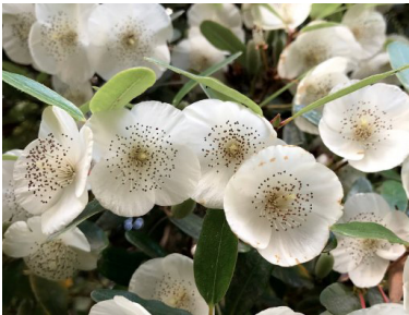
Leatherwood – Eucryphia lucida The Leatherwood is endemic to Tasmania and grows in wet rainforests from the centre to the western half of the state. It is famous for the special perfumed honey produced from its sweet nectar and is in flower in spring & summer.